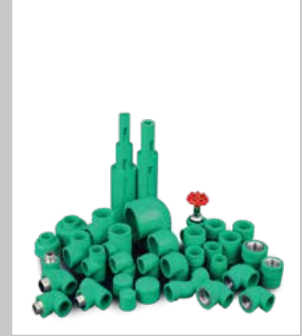
PPRC Pipes & Fittings