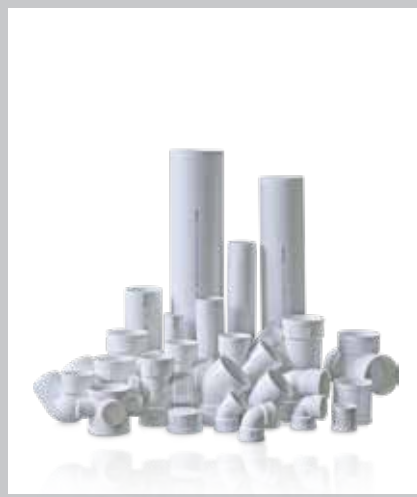
UPVC PIPES & FITTINGS