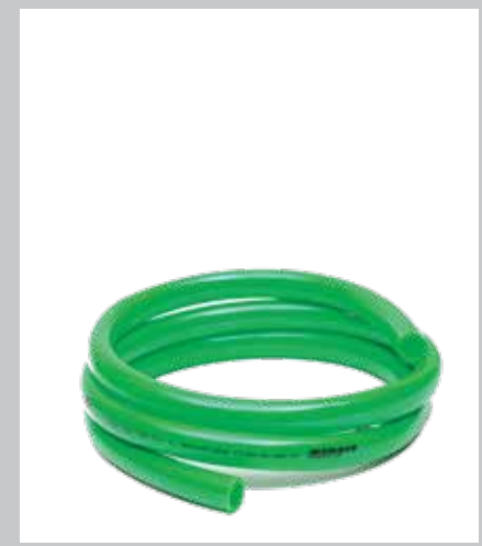
Garden Hose Pipes