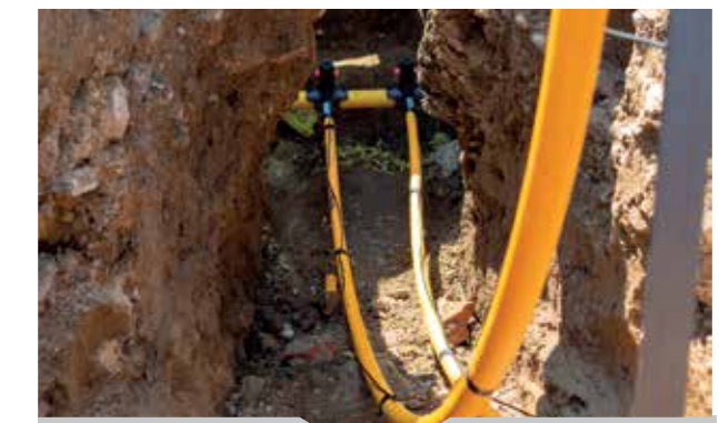
Yellow MDPE for Gas Distribution