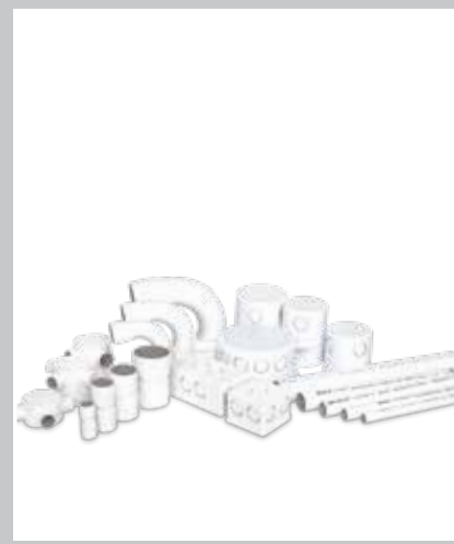
Electric Conduit Pipe & Fittings