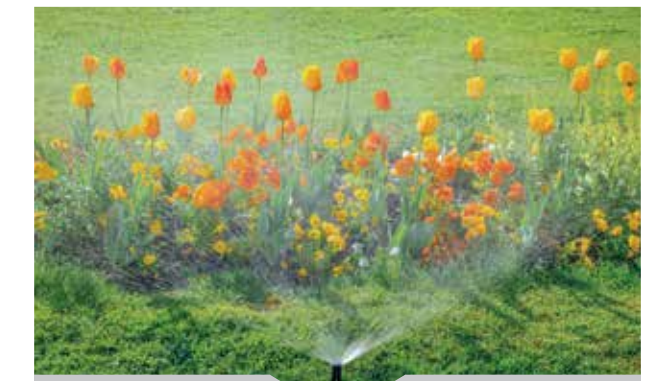
Sprinklers & Drip Irrigation