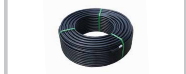
Size 20mm to 63mm 75mm to 110mm Length 100 meter (max) 50 meter (max)