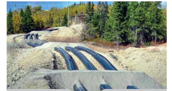
Potable Water City Pipe Network