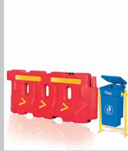
Road Safety Barriers & Garbage Bins