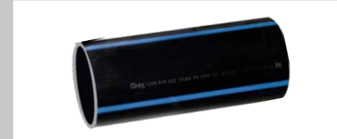
Size 20mm to 450mm Length 6 meter & 12 meter